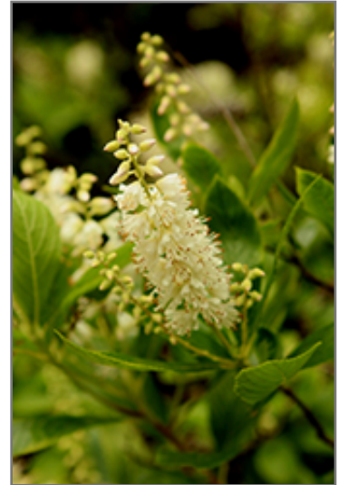
Summersweet flowers

Summersweet is recommended for the following landscape applications;