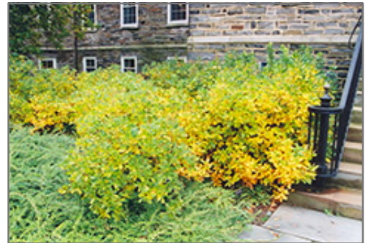
Summersweet in fall