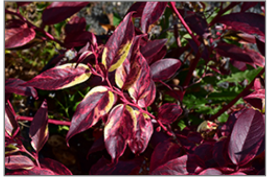
Rainbow Fetterbush in fall

Rainbow Fetterbush makes a fine choice for the outdoor landscape, but it is also well-suited for use in outdoor pots and containers. Because of its height, it is often used as a 'thriller' in the 'spiller-thriller-filler' container combination; plant it near the center of the pot, surrounded by smaller plants and those that spill over the edges. It is even sizeable enough that it can be grown alone in a suitable container. Note that when grown in a container, it may not perform exactly as indicated on the tag - this is to be expected. Also note that when growing plants in outdoor containers and baskets, they may require more frequent waterings than they would in the yard or garden.