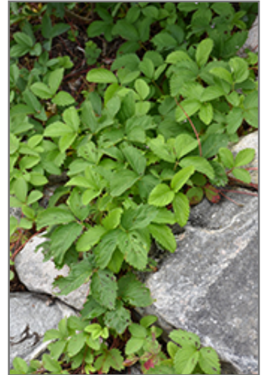
Common Wild Strawberry

Common Wild Strawberry is a good choice for the edible garden, but it is also well-suited for use in outdoor pots and containers. Because of its spreading habit of growth, it is ideally suited for use as a 'spiller' in the 'spiller-thriller-filler' container combination; plant it near the edges where it can spill gracefully over the pot. Note that when growing plants in outdoor containers and baskets, they may require more frequent waterings than they would in the yard or garden.