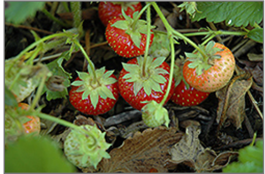
Common Wild Strawberry

Common Wild Strawberry features dainty white cup-shaped flowers with yellow eyes along the stems from late spring to early summer. Its attractive tomentose round compound leaves remain green in colour throughout the season. It features an abundance of magnificent cherry red berries from late spring to late summer.