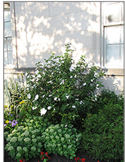
Diana Rose of Sharon in bloom