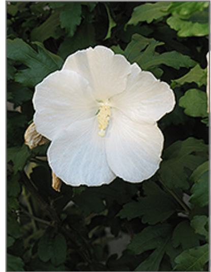
Diana Rose of Sharon flowers