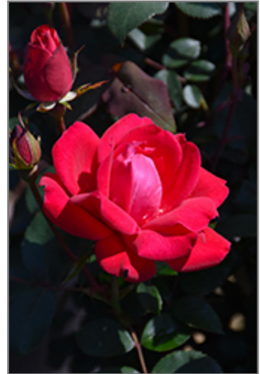
Double Knock Out Rose flowers

Double Knock Out Rose is recommended for the following landscape applications;