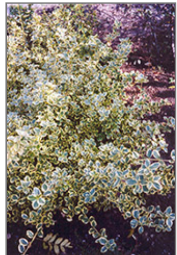
Canadale Gold Wintercreeper