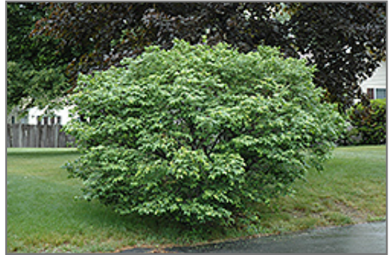
Compact Winged Burning Bush

This shrub performs well in both full sun and full shade. It is very adaptable to both dry and moist locations, and should do just fine under average home landscape conditions. It is not particular as to soil type or pH. It is highly tolerant of urban pollution and will even thrive in inner city environments. This is a selected variety of a species not originally from North America.