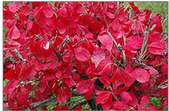
Compact Winged Burning Bush in fall