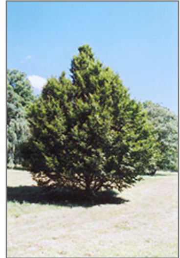
American Hornbeam

The American Hornbeam is recommended for the following landscape applications;