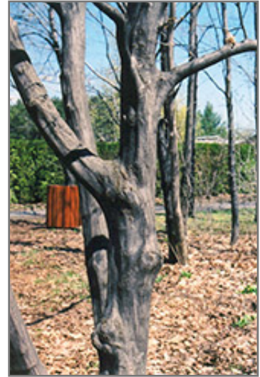
American Hornbeam bark

This tree performs well in both full sun and full shade. It is an amazingly adaptable plant, tolerating both dry conditions and even some standing water. It is not particular as to soil type or pH. It is somewhat tolerant of urban pollution. This species is native to parts of North America.