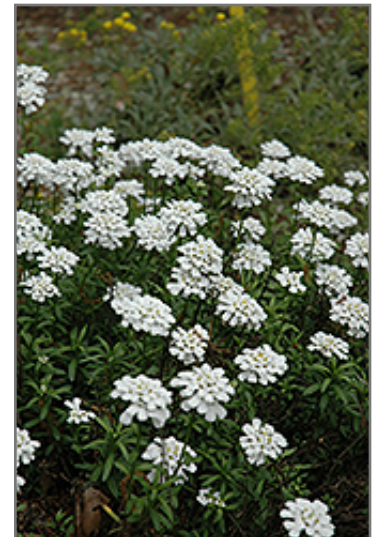
Purity Candytuft flowers