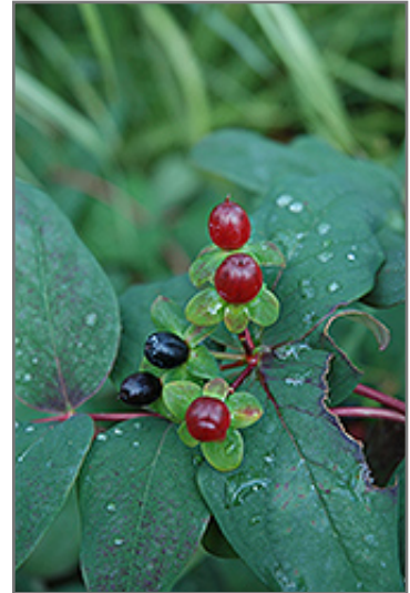
Albury Purple St. John's Wort fruit

Albury Purple St. John's Wort makes a fine choice for the outdoor landscape, but it is also well-suited for use in outdoor pots and containers. With its upright habit of growth, it is best suited for use as a 'thriller' in the 'spiller-thriller-filler' container combination; plant it near the center of the pot, surrounded by smaller plants and those that spill over the edges. It is even sizeable enough that it can be grown alone in a suitable container. Note that when grown in a container, it may not perform exactly as indicated on the tag - this is to be expected. Also note that when growing plants in outdoor containers and baskets, they may require more frequent waterings than they would in the yard or garden.