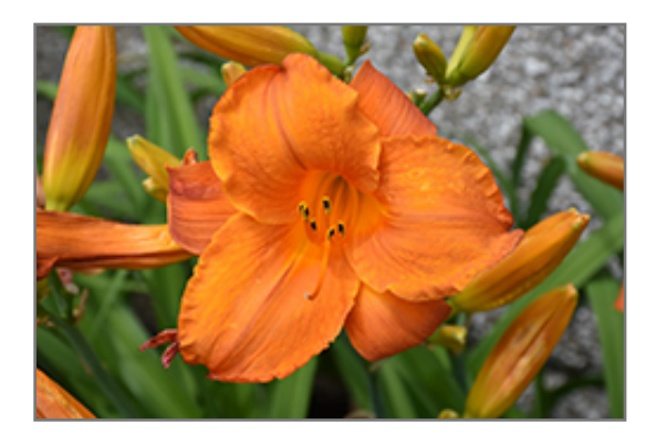
Mauna Loa Daylily flowers

heeman.ca | 519.461.1416 20422 Nissouri Road Thorndale, ON NOM 2P0 Family owned and operated since 1963. Open year-round.