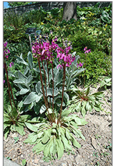
Aphrodite Shooting Star in bloom