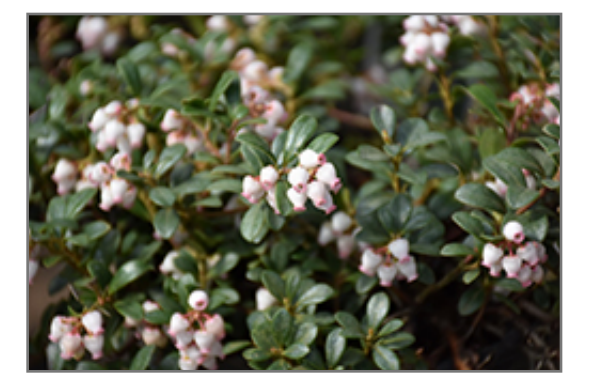
Massachusetts Bearberry flowers

Massachusetts Bearberry features dainty nodding shell pink bell-shaped flowers at the ends of the branches in mid spring. It features an abundance of magnificent red berries from late summer to late fall. It has forest green evergreen foliage. The tiny glossy round leaves turn burgundy in the fall, which persists throughout the winter.