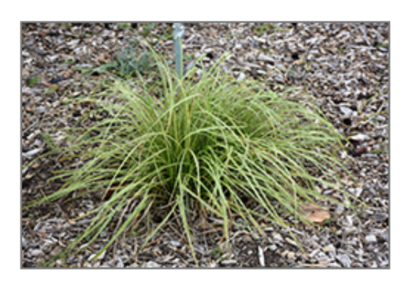
Gold Fountains Sedge