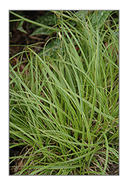
Gold Fountains Sedge foliage

This is a relatively low maintenance plant, and is best cleaned up in early spring before it resumes active growth for the season. It has no significant negative characteristics.