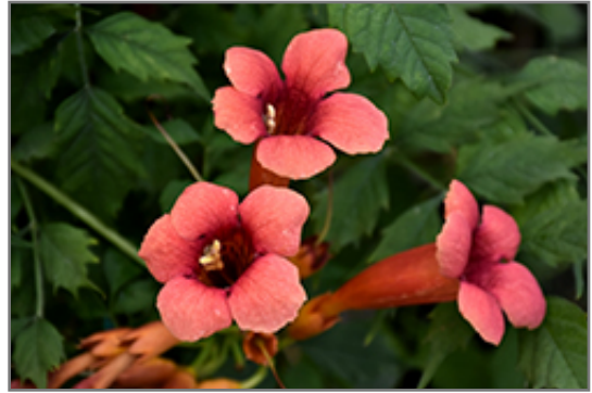
Flamenco Trumpetvine flowers