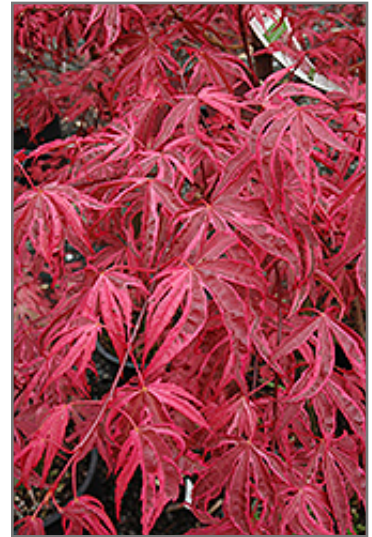
Shirazz Japanese Maple foliage