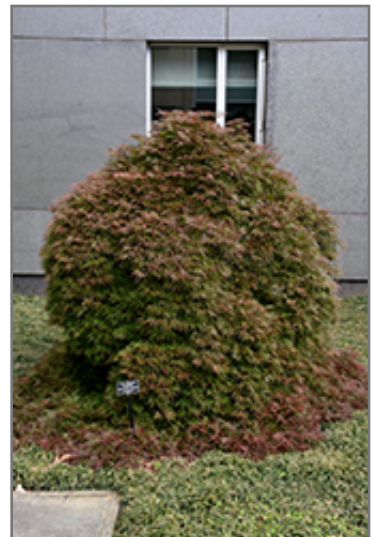
Orangeola Cutleaf Japanese Maple