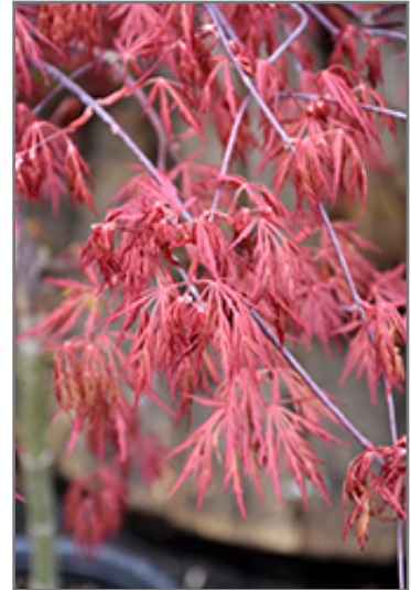
Orangeola Cutleaf Japanese Maple foliage

Orangeola Cutleaf Japanese Maple is a fine choice for the yard, but it is also a good selection for planting in outdoor pots and containers. Because of its height, it is often used as a 'thriller' in the 'spiller-thriller-filler' container combination; plant it near the center of the pot, surrounded by smaller plants and those that spill over the edges. It is even sizeable enough that it can be grown alone in a suitable container. Note that when grown in a container, it may not perform exactly as indicated on the tag - this is to be expected. Also note that when growing plants in outdoor containers and baskets, they may require more frequent waterings than they would in the yard or garden.