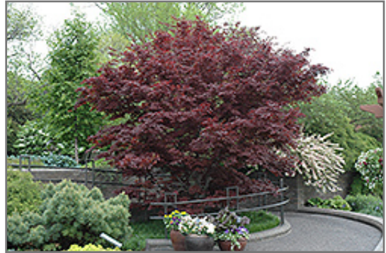
Bloodgood Japanese Maple