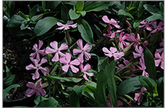
Max Frei Soapwort flowers