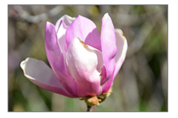
Jane Magnolia flowers

An exceptional shrub with large reddish purple flowers on the outside, white inside; flowers tend to open later and avoid frost damage; flowers are a gorgeous tulip shape with a lightly scented fragrance; great choice for border or accent