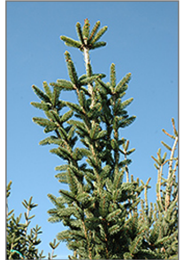
Columnar Norway Spruce foliage