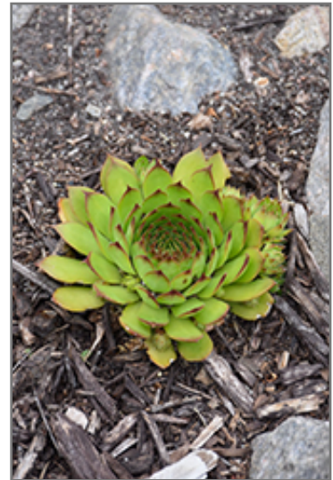
Sunset Hens And Chicks