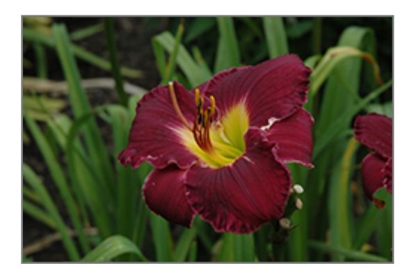
Bela Lugosi Daylily flowers

heeman.ca | 519.461.1416 20422 Nissouri Road Thorndale, ON NOM 2P0 Family owned and operated since 1963. Open year-round.