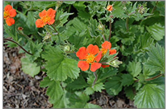
Boris Avens flowers

Boris Avens is recommended for the following landscape applications;