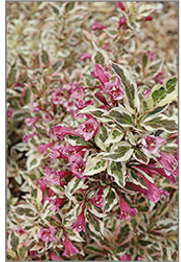
My Monet Weigela flowers

My Monet Weigela is recommended for the following landscape applications;