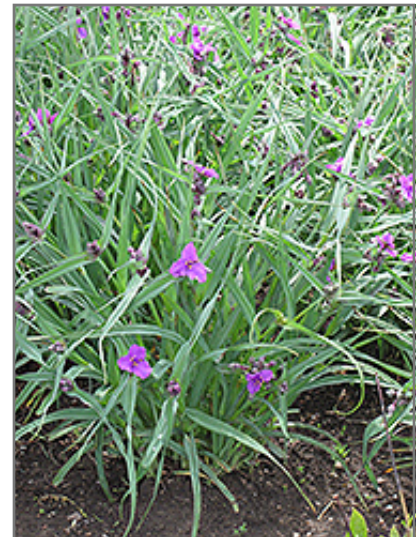
Concord Grape Spiderwort in bloom