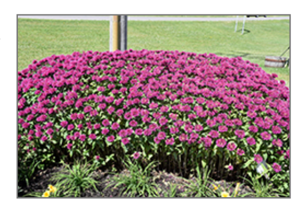
Grand Marshall Beebalm in bloom