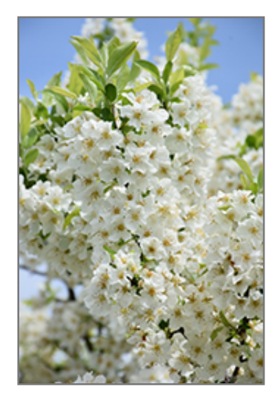
Lollipop Flowering Crab flowers