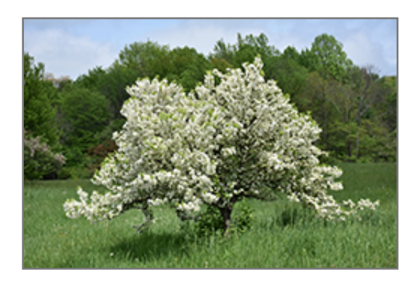
Lollipop Flowering Crab in bloom

heeman.ca | 519.461.1416 20422 Nissouri Road Thorndale, ON N0M 2P0 Family owned and operated since 1963. Open year-round.