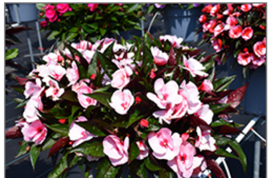
Petticoat Cherry Blossom New Guinea Impatiens in bloom