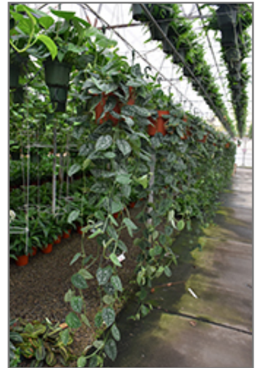
Argyraeus Pothos in full

-- THIS IS A TROPICAL PLANT AND SHOULD NOT BE EXPECTED TO SURVIVE THE WINTER OUTDOORS IN OUR CLIMATE --