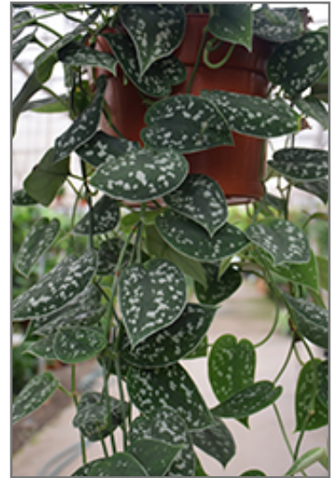
Argyraeus Pothos foliage