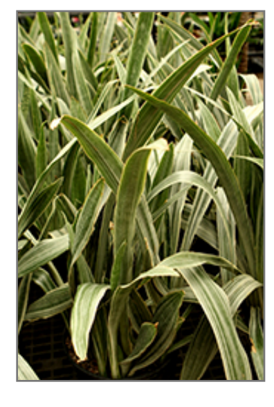
Sayuri Snake Plant foliage

When grown indoors, Sayuri Snake Plant can be expected to grow to be about 3 feet tall at maturity, with a spread of 18 inches. It grows at a slow rate, and under ideal conditions can be expected to live for approximately 10 years. This houseplant performs well in both bright or indirect sunlight and strong artificial light, and can therefore be situated in almost any well-lit room or location. It is very adaptable to both dry and moist soil, and should do just fine under average home conditions. The surface of the soil shouldn't be allowed to dry out completely, and so you should expect to water this plant once and possibly even twice each week. Be aware that your particular watering schedule may vary depending on its location in the room, the pot size, plant size and other conditions; if in doubt, ask one of our experts in the store for advice. It will benefit from a regular feeding with a general-purpose fertilizer with every second or third watering. It is not particular as to soil pH, but grows best in sandy soil. Contact the store for specific recommendations on pre-mixed potting soil for this plant.