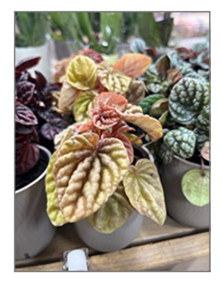
Quito Peperomia in full

heeman.ca | 519.461.1416 20422 Nissouri Road Thorndale, ON NOM 2P0 Family owned and operated since 1963. Open year-round.