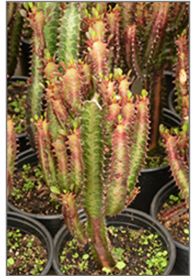
Rubra African Milk Tree in full