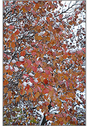
Bradford Ornamental Pear in fall

This tree should only be grown in full sunlight. It prefers to grow in average to moist conditions, and shouldn't be allowed to dry out. It is not particular as to soil type or pH. It is highly tolerant of urban pollution and will even thrive in inner city environments. This is a selected variety of a species not originally from North America.