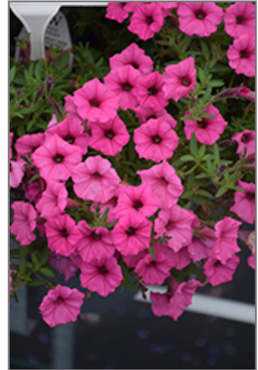
Supertunia Mini Vista Hot Pink Petunia flowers

Supertunia Mini Vista Hot Pink Petunia is recommended for the following landscape applications;