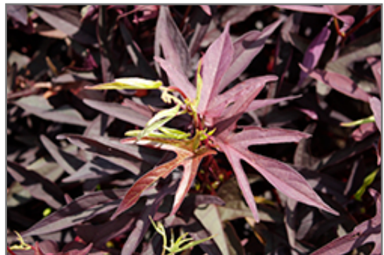
Sweet Caroline Upside Black Coffee Sweet Potato Vine foliage