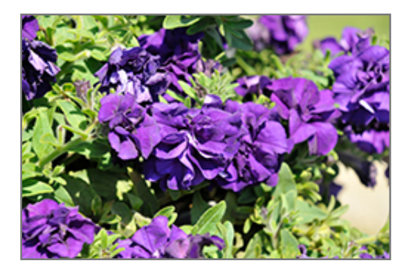
Vogue Blue Double Petunia flowers

20422 Nissouri Road Thorndale, ON N0M 2P0 Family owned and operated since 1963. Open year-round.