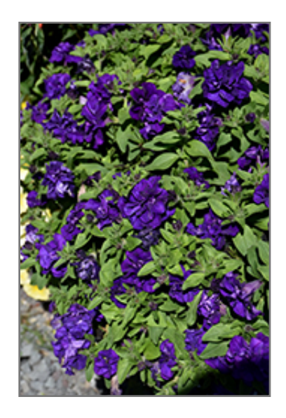
Vogue Blue Double Petunia flowers