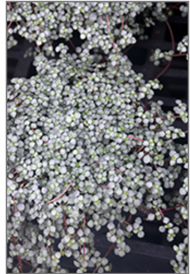
Aquamarine Pilea foliage