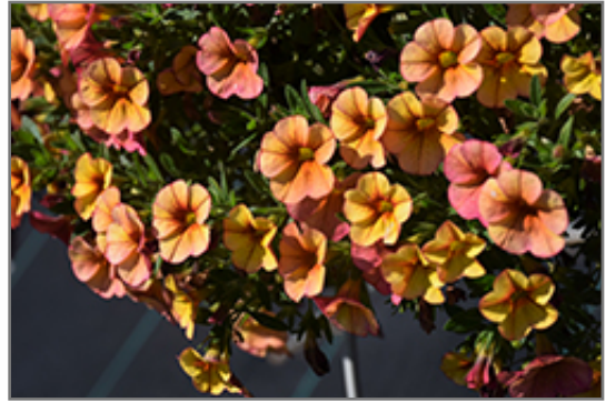
MiniFamous Uno Orange + Red Vein Calibrachoa flowers

This plant will require occasional maintenance and upkeep. Trim off the flower heads after they fade and die to encourage more blooms late into the season. It is a good choice for attracting bees and hummingbirds to your yard, but is not particularly attractive to deer who tend to leave it alone in favor of tastier treats. It has no significant negative characteristics.