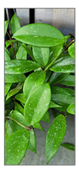
Hoya Pubicalyx foliage

When grown indoors, Hoya Pubicalyx can be expected to grow to be about 6 feet tall at maturity, with a spread of 24 inches. It grows at a medium rate, and under ideal conditions can be expected to live for approximately 10 years. This houseplant should be situated in a location that that gets indirect sunlight at most, although it will usually require a more brightly-lit environment than what artificial indoor lighting alone can provide. It is very adaptable to both dry and moist soil, but will not tolerate any standing water. The surface of the soil shouldn't be allowed to dry out completely, and so you should expect to water this plant once and possibly even twice each week. Be aware that your particular watering schedule may vary depending on its location in the room, the pot size, plant size and other conditions; if in doubt, ask one of our experts in the store for advice. It will benefit from a regular feeding with a general-purpose fertilizer with every second or third watering. It is not particular as to soil pH, but grows best in rich soil. Contact the store for specific recommendations on pre-mixed potting soil for this plant.