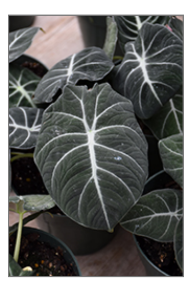
Mythic Black Velvet Jewel Alocasia foliage

This is an open herbaceous evergreen houseplant with an upright spreading habit of growth. This plant usually looks its best without pruning, although it will tolerate pruning.