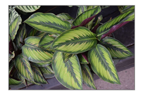
Color Full Beauty Star Pinstripe Calathea foliage

heeman.ca | 519.461.1416 20422 Nissouri Road Thorndale, ON NOM 2P0 Family owned and operated since 1963. Open year-round.