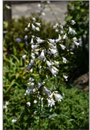
Foxglove Beardtongue flowers

Foxglove Beardtongue is recommended for the following landscape applications;