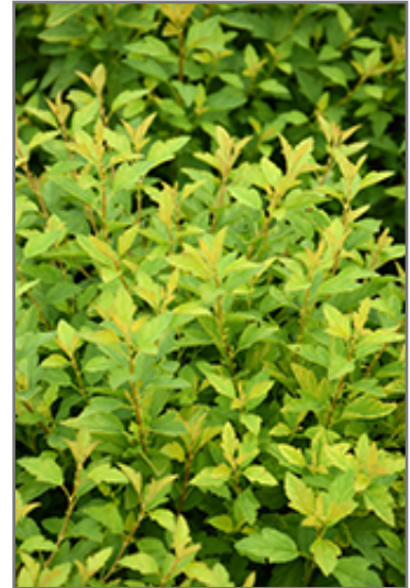
Raspberry Lemonade Ninebark foliage

Raspberry Lemonade Ninebark is recommended for the following landscape applications;