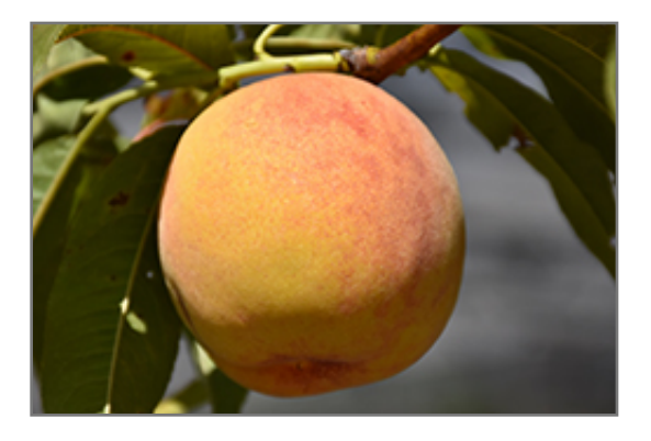
Reliance Peach fruit

20422 Nissouri Road Thorndale, ON NOM 2P0 Family owned and operated since 1963. Open year-round.