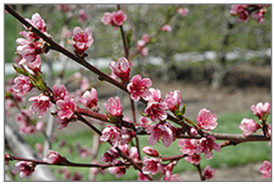
Reliance Peach flowers