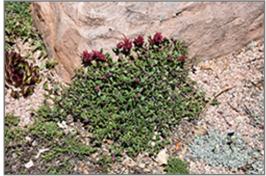
Marian Sampson Scarlet Monardella in bloom

Marian Sampson Scarlet Monardella will grow to be only 3 inches tall at maturity extending to 5 inches tall with the flowers, with a spread of 12 inches. When grown in masses or used as a bedding plant, individual plants should be spaced approximately 8 inches apart. Its foliage tends to remain low and dense right to the ground. It grows at a medium rate, and under ideal conditions can be expected to live for approximately 3 years. As an evergreen perennial, this plant will typically keep its form and foliage year-round.