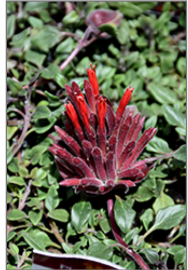
Marian Sampson Scarlet Monardella flowers

This is a relatively low maintenance plant, and should not require much pruning, except when necessary, such as to remove dieback. It is a good choice for attracting hummingbirds to your yard. It has no significant negative characteristics.