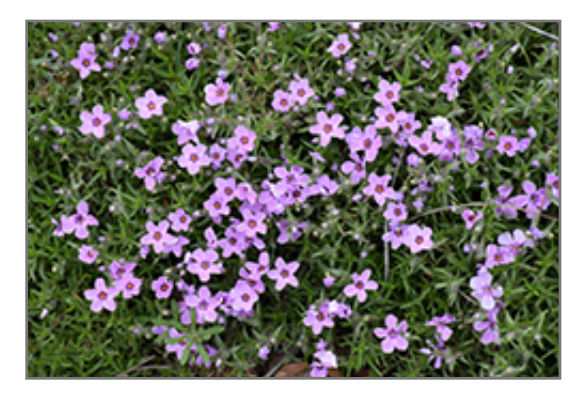
Eye Shadow Creeping Phlox flowers