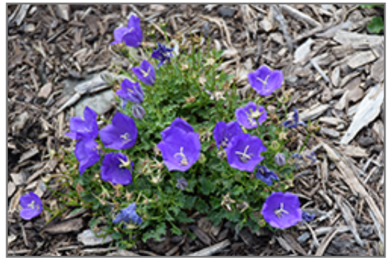
Pearl Deep Blue Bellflower in bloom