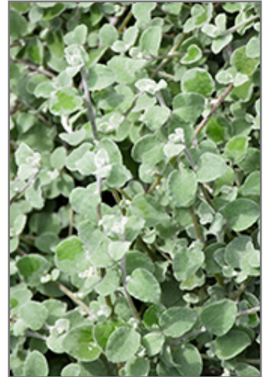
Silver Licorice Plant foliage