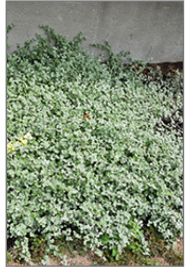
Silver Licorice Plant

Silver Licorice Plant is a fine choice for the garden, but it is also a good selection for planting in outdoor containers and hanging baskets. Because of its trailing habit of growth, it is ideally suited for use as a 'spiller' in the 'spiller-thriller-filler' container combination; plant it near the edges where it can spill gracefully over the pot. Note that when growing plants in outdoor containers and baskets, they may require more frequent waterings than they would in the yard or garden.