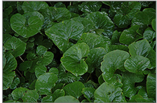
Canadian Wild Ginger